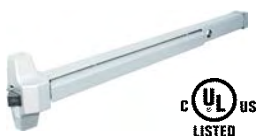
Rim-Type Exit Device