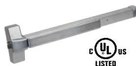
Rugged Grade 1 Rim-Type Exit Device