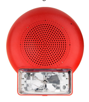
Figure 1: TrueAlert ES addressable A/V